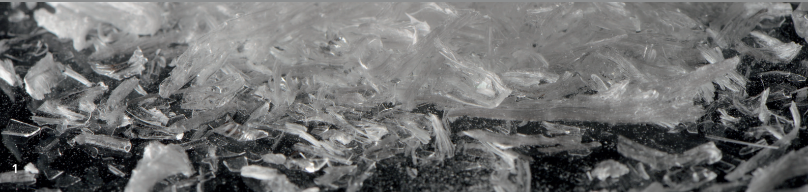
1 Finely crushed glass flakes with defined porosity